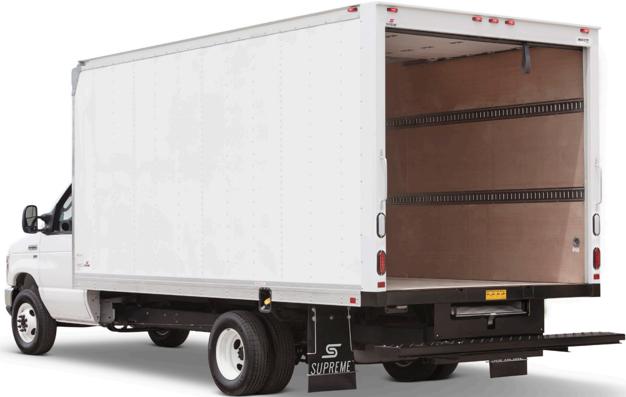
Base model shown with added options