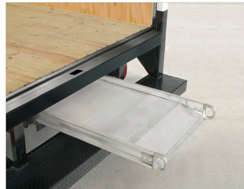
Aluminum Slider Ramp

Call 800-642-4889 Online supremetruckbody.com